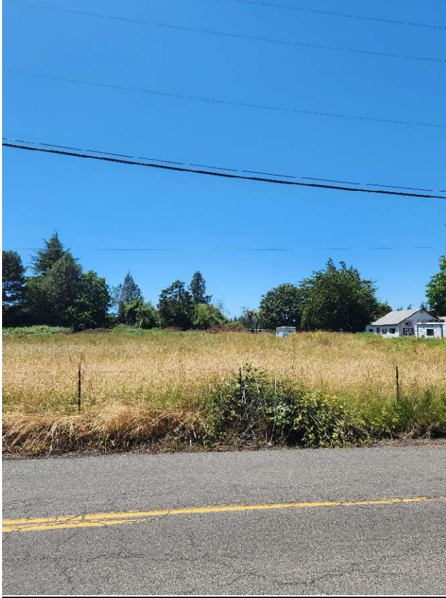
Property View West